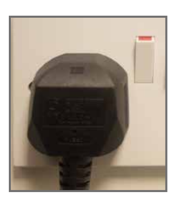
2 . Plug the charger into a suitable socket outlet.