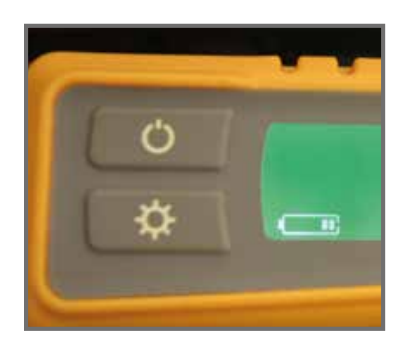
3. The battery indicator on the charging panel will stay Green and flash to show the level of charge. When the battery is charged it will stop flashing.