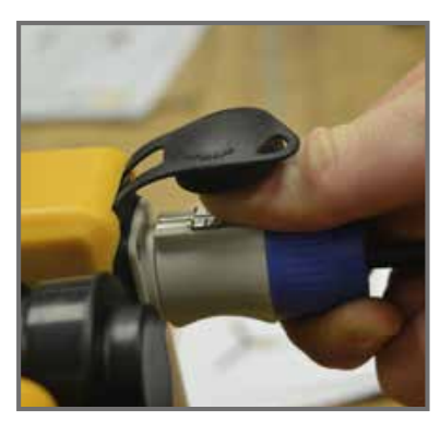
1 . Plug the charger into the socket on the Solaris Pro.