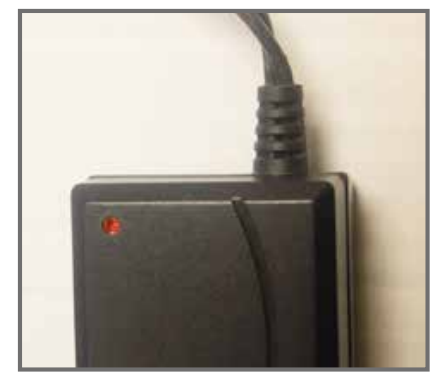
3. The indicator on the charger will illuminate red when charging and green when fully charged.