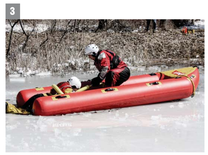
Pull the patient onto the inner bed of the boat.