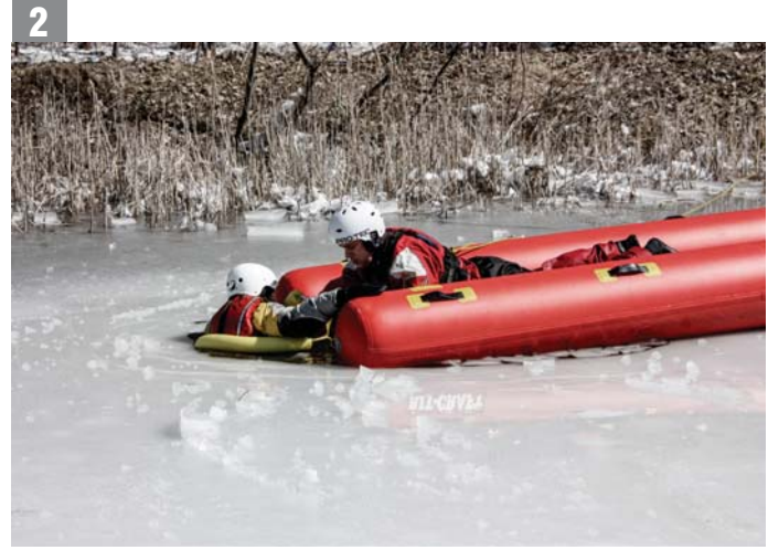
Once in contact, make sure to maintain a firm grip on the patient. Draw the patient to the rear of the craft.