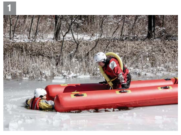
Approach from a downwind direction and safely make contact with the patient.