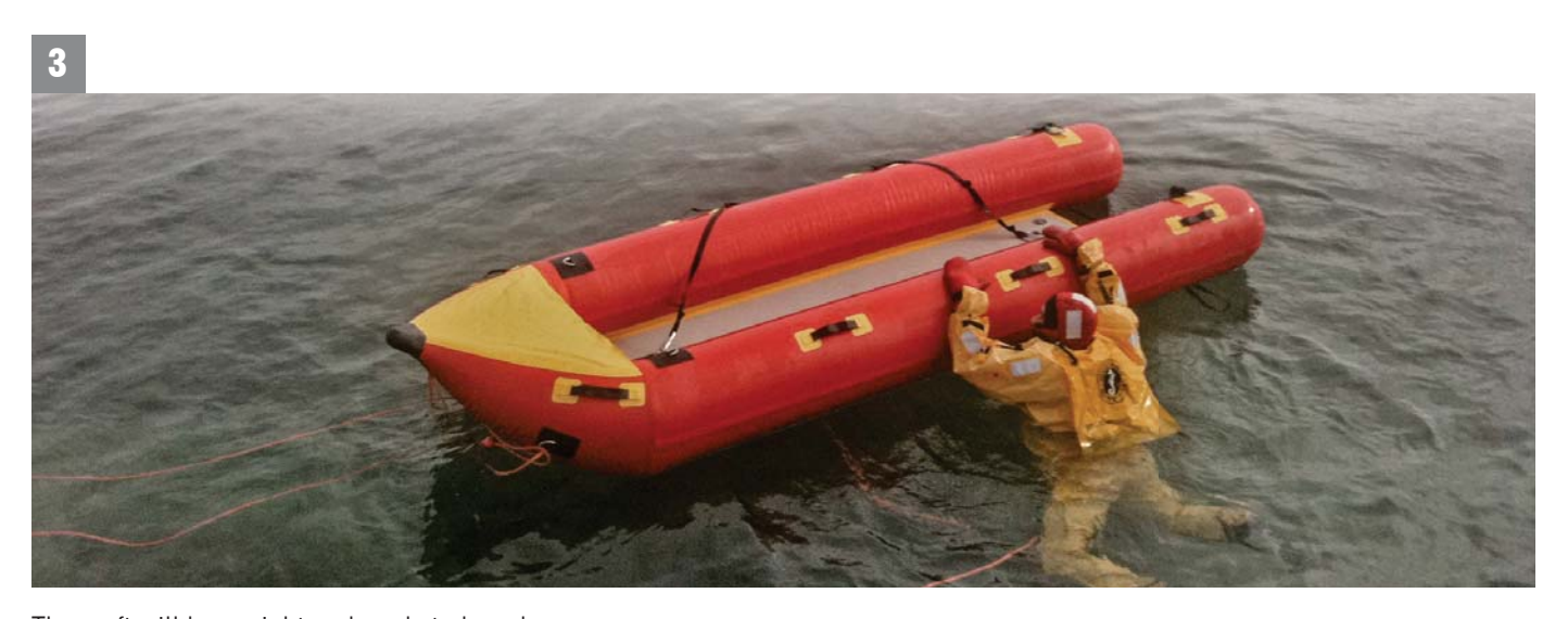
The craft will be upright and ready to board.