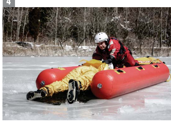
Once the patient is securely onboard, check vital signs, then signal shore to retrieve.