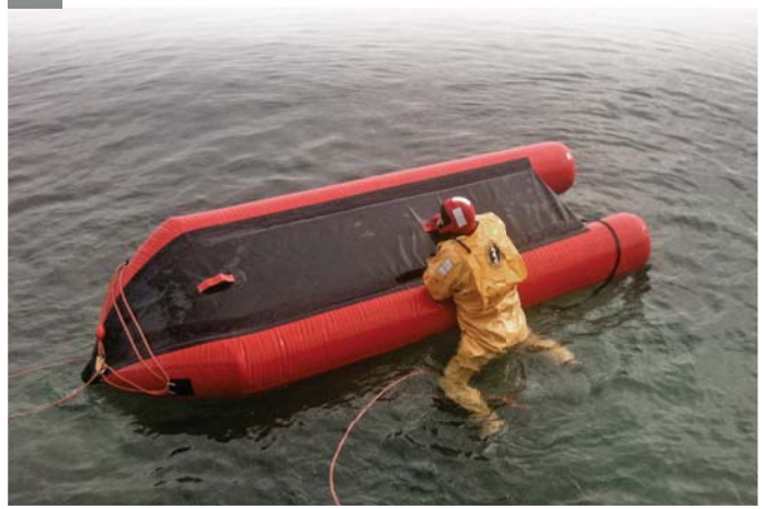
Maintain constant contact with the overturned craft.