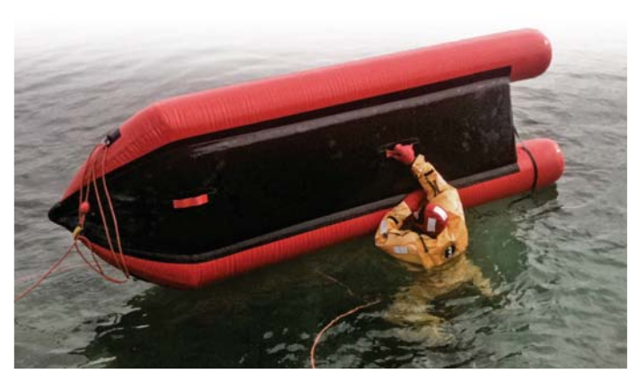
Grasping one of the bottom handles, push with opposite hand down and outward on the craft while pulling the handle toward yourself.